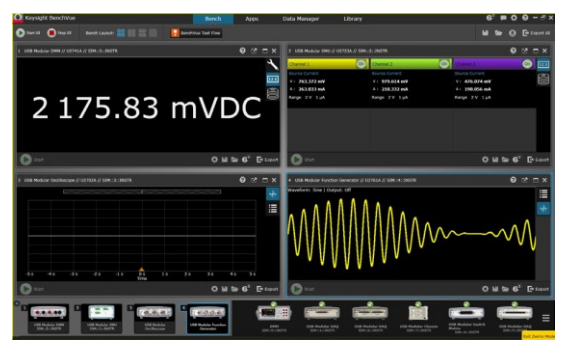
Figure 7. View measurements across USB DAQ, modular, and bench instruments all on one BenchVue interface.

The USB Modular Switch Matrix App within BenchVue allows you to quickly configure and control the U2751A Switch Matrix across its 32 cross points and visualize the number of times each relay is used.