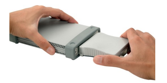
Figure 1. U2922A with U2751A used as a standalone device

The U2922A terminal block is an optional accessory to be used with the U2751A. The U2922A, which weighs approximately 100 g with screw-type terminals, offers you a convenient and simple way of making the connection to the switch matrix for prototyping applications or an actual system deployment. It allows the user to configure a wide variety of routing options and matrix topologies