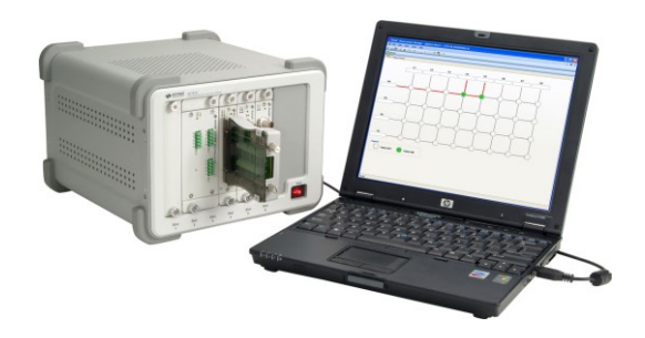
Figure 2. U2751A with U2922A used as a modular device

Figure 1. U2922A with U2751A used as a standalone device